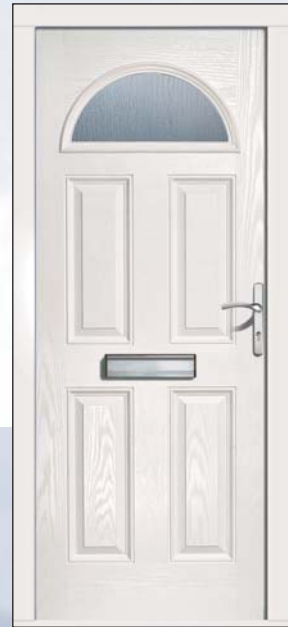
Tuscan One Glazed