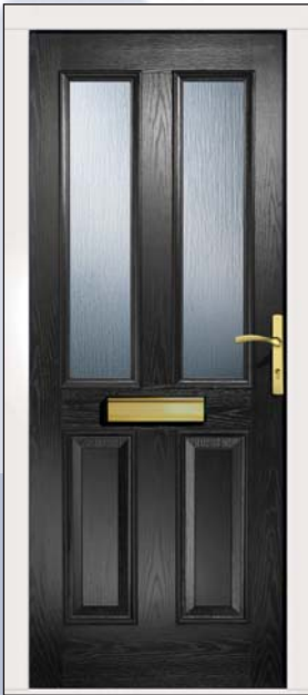
Esprit Two Glazed