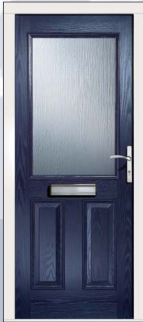
Mulsanne One Glazed