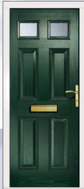
Camarque Two Glazed